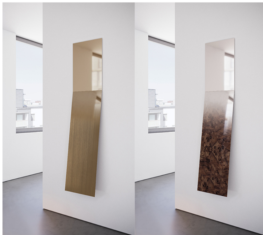
Mirror/Zero Fading Brass and Fading Wood