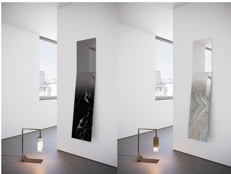
Mirror/Zero Black Edition and Fading Marble

Formaminima operates with the aim of keeping each step in the local supply chain short. In an attempt to satisfy this attitude toward operating ethically, the brand carefully chooses materials and shipping facilities that not only preserve the slow design process but also deliver good-quality products to the collector.