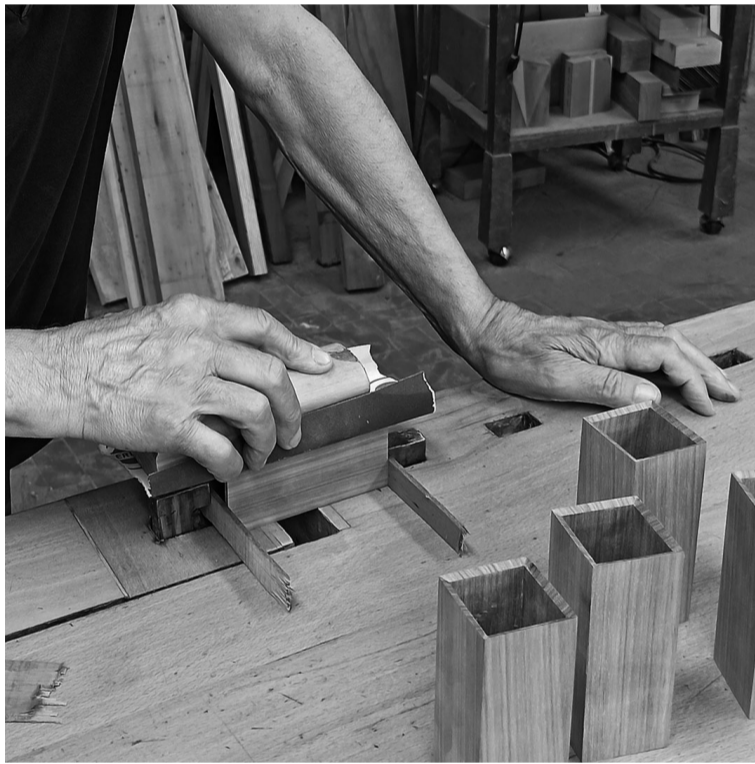
Making of the lamp: Behind the Scenes

Vrabec, who has worked in the disciplines of product design , branding , and art direction, constructs the pieces for her brand using well-ground crystal glass that softly diffuses light, satin brass that is sturdy yet fine and lightweight, solid marble sheets that are thin enough for light to pass through, wood surfaces finished with a layer of ebony, and porcelain shells as thin as an eggshell. Light is distributed in varying intensities and textures by the five materials, which have varying levels of transparency and translucency. "Thinness, lightness, transparency, and shade, just to mention a few, were the project boundaries, the main frame that helped define the context and turn those possibilities into suggested solutions, represented by the pieces developed by us," shares Vrabec.