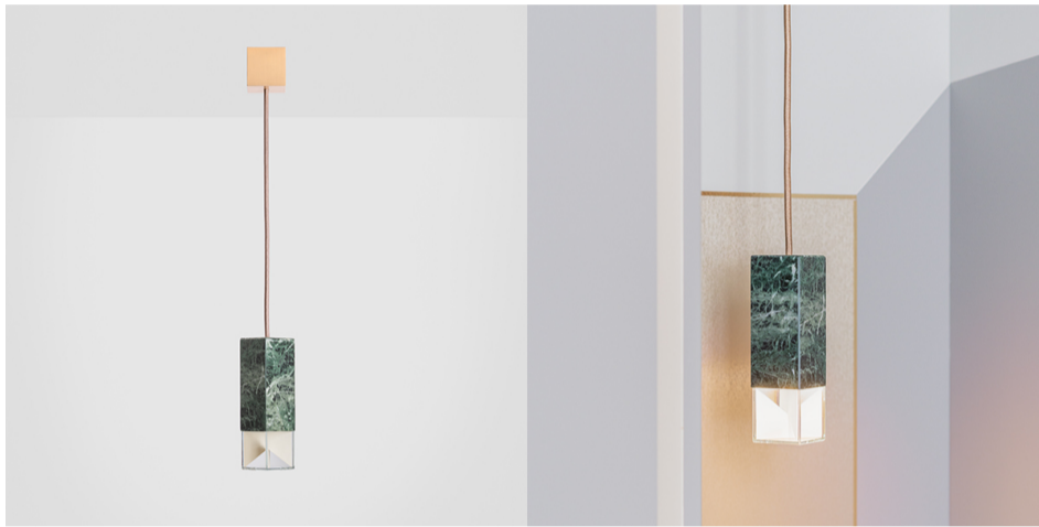
Lamp/One Green