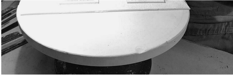
Folding and gluing the individual components

Vrabec, who has worked in the disciplines of product design , branding , and art direction, constructs the pieces for her brand using well-ground crystal glass that softly diffuses light, satin brass that is sturdy yet fine and lightweight, solid marble sheets that are thin enough for light to pass through, wood surfaces finished with a layer of ebony, and porcelain shells as thin as an eggshell. Light is distributed in varying intensities and textures by the five materials, which have varying levels of transparency and translucency. "Thinness, lightness, transparency, and shade, just to mention a few, were the project boundaries, the main frame that helped define the context and turn those possibilities into suggested solutions, represented by the pieces developed by us," shares Vrabec.