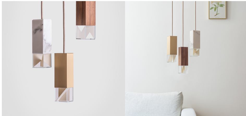
Lamp/One Collection Chandelier

The Lamp/s Collection by Formaminima comes in several styles and material variations. For instance, the Lamp/One series, a single suspension lamp, comes in materials such as olive briarwood, Arabescato Orobico solid marble, Palissandro Blu Nuvolato solid marble, white Calacatta marble, Royal Pink Yellow marble, Red Collemandina Marble, Green Alpes marble, solid brass in different finishes, and Canaletto walnut wood. Other variations of Lamp/One include trio chandeliers and six-light chandelier made using materials such as black and gold marble, solid Calacatta marble, Red Collemandina marble, Green Alpi marble, Arabescato Orobico marble, Palissandro Blu Nuvolato marble, Royal Pink Yellow marble, satin brass, and Canaletto walnut wood. Lamp/Two, a table lamp, also comes in different textures and colour variations of brass, marble, and wood.