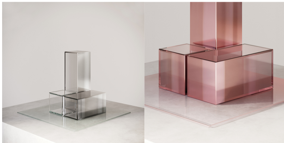
Sunrise decor box and Dazzle decor box