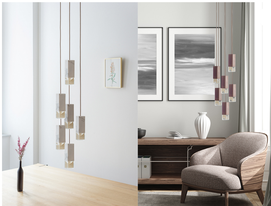
Lamp/One Marble Chandelier

The Lamp/s Collection by Formaminima comes in several styles and material variations. For instance, the Lamp/One series, a single suspension lamp, comes in materials such as olive briarwood, Arabescato Orobico solid marble, Palissandro Blu Nuvolato solid marble, white Calacatta marble, Royal Pink Yellow marble, Red Collemandina Marble, Green Alpes marble, solid brass in different finishes, and Canaletto walnut wood. Other variations of Lamp/One include trio chandeliers and six-light chandelier made using materials such as black and gold marble, solid Calacatta marble, Red Collemandina marble, Green Alpi marble, Arabescato Orobico marble, Palissandro Blu Nuvolato marble, Royal Pink Yellow marble, satin brass, and Canaletto walnut wood. Lamp/Two, a table lamp, also comes in different textures and colour variations of brass, marble, and wood.