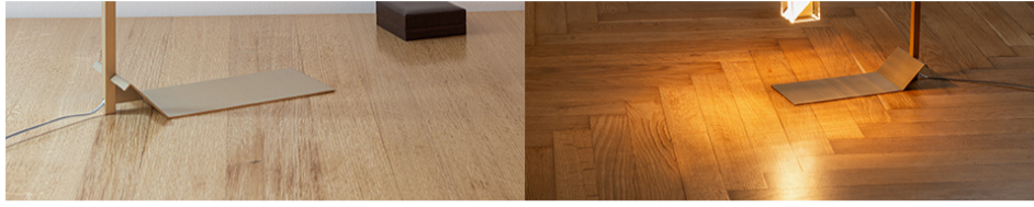
Lamp Two Yellow and Lamp Two Green from the Lamp/s Collection